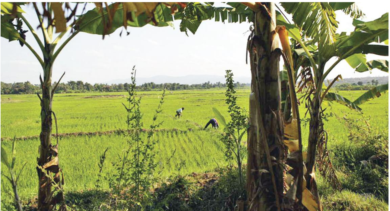
Intensive rice cultivation in the Pangani Basin

The Pangani River Basin Management project was also a catalyst for the creation of the Wami Ruvu project which is focusing on building water governance capacity to secure the future of the Ruvu River in the Wami Ruvu Basin. The results from Pangani and the lessons learned have supported the roll-out of the Wami Ruvu project and activities at the national level as well as water governance projects in Uganda and Kenya and wider across the Western Indian Ocean Region through projects such as Wio-Lab.