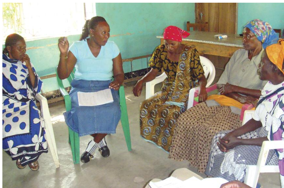
Climate change vulnerability assessment in Mbuguni Village

As a result of experience in the Pangani, a global Environmental Flows Network was established ( www.eflownet.org ) to facilitate awareness raising, capacity building and implementation of environmental flows within East and Southern Africa and worldwide. The Network's overall aim is to allow people to access, share and discuss information, knowledge, experiences and case studies related to environmental flows. The environmental flows