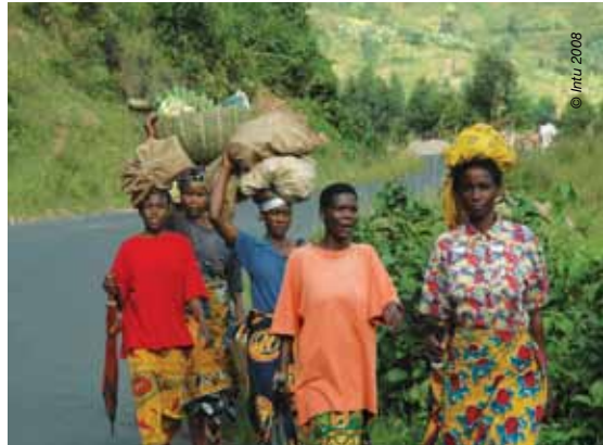
Women walking along the road to Bujumbura, Burundi

World Bank. (2004). "Natural Disasters: Counting the Cost". Press release, March 2, 2004. Available at: http://www.worldbank.org