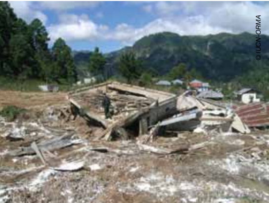
Post tropical storm Stan, Guatemala