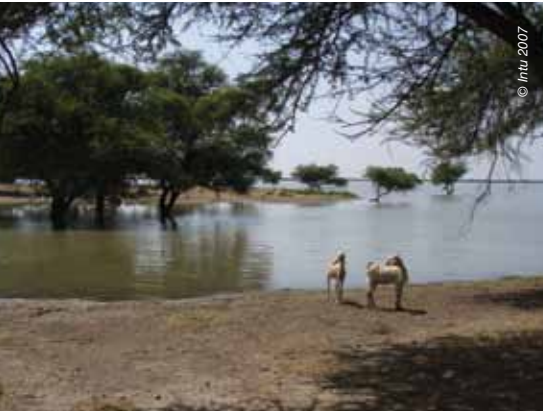
Flood in Shagarab, Eastern Sudan