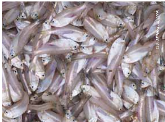
Sprats, Sri Lanka