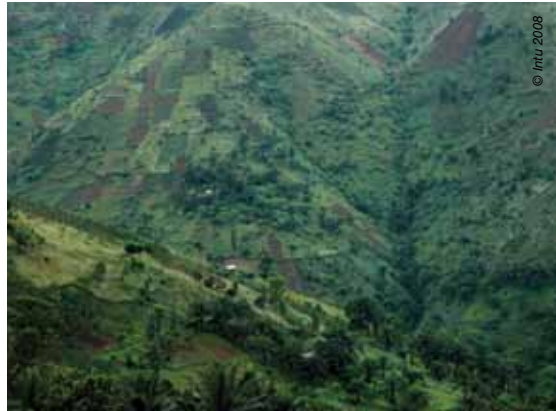
Bururi Province, Burundi