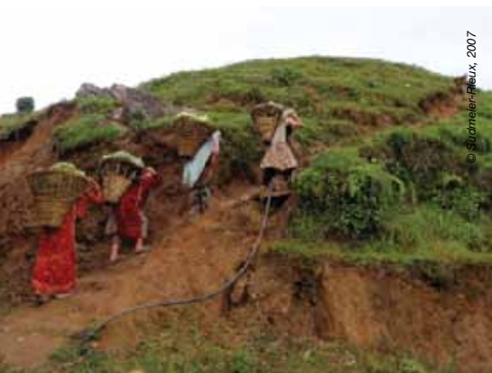
Women bringing cabbages to market, Nepal