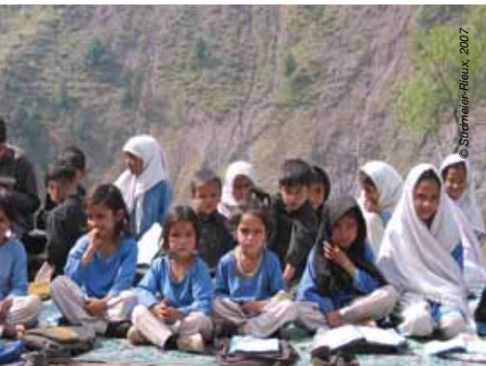
Open-air school, post-earthquake Pakistan