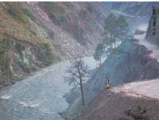
Pakistan earthquake and landslides, 2007

The Millennium Ecosystem Assessment (MA), a five-year international assessment initiative, clearly demonstrated the strong and varied links between human well-being, human security, livelihoods, health and intangible benefits such as equality and freedom of choice, with ecosystem services. The MA also highlighted that ecosystem degradation is undermining this link due to a number of human activities, mainly: