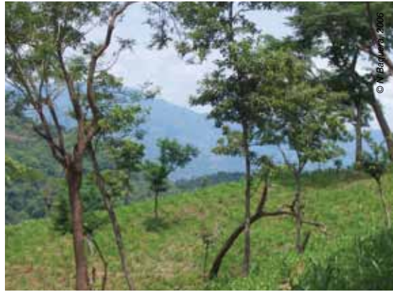
Agro-forestry, Lempira, Honduras

In remote villages of hilly southwest Honduras, local farmers have an age-old trick to protect their crops from hurricanes. Thousands of resource-poor farmers have readopted and adapted traditional farming techniques which have substantially improved their livelihoods and provide them with multiple benefits and at the same time successfully reduced impacts of natural disasters.