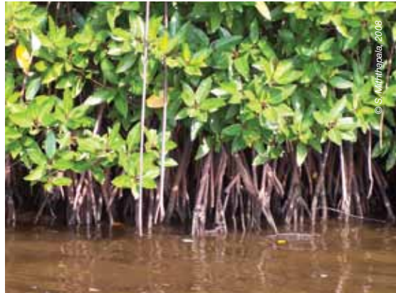
Mangroves, providing spawning grounds for numerous fish species, Sri Lanka

This is of particular relevance to the field of disaster risk management as it is a meeting point for enhanced livelihood security for the poor and long-term management of ecosystems. It is a strategy consistent with the Ecosystem Approach of the Convention on Biological Diversity, for the integrated management of land, water and living resources for human benefits as well as conservation goals (See Annex 1). Ecosystem-based DRR recognizes that ecosystems are not isolated but connected through the biodiversity, water, land, air and people that they constitute and support (Shepherd, 2008). Sustainable ecosystem management is based on equitable stakeholder involvement in land management decisions, land-use trade-offs and long-term goal setting. These are central elements to reducing underlying risk factors for disasters and climate change impacts 2 .