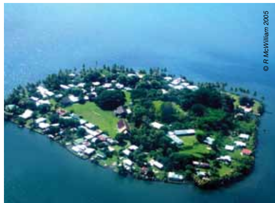
An island village, Fiji