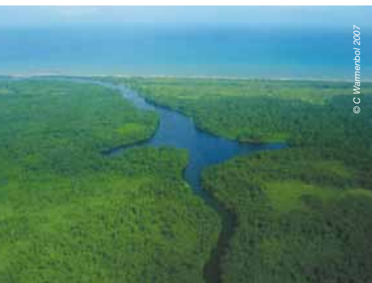
El Cangrejal river, Honduras

Environmental Vulnerability Index (2004)