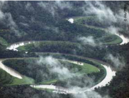
Mamberamo River, Papua Indonesia

The negative impacts of climate change and disaster events are more severe on vulnerable people and, at the same time, they are creating greater population vulnerability for those living in the conditions of socio-economic exclusion, including women and children. This is due to increasing environmental degradation , populations living in more exposed areas , more extreme weather events and the social and governance factors that affect livelihoods.