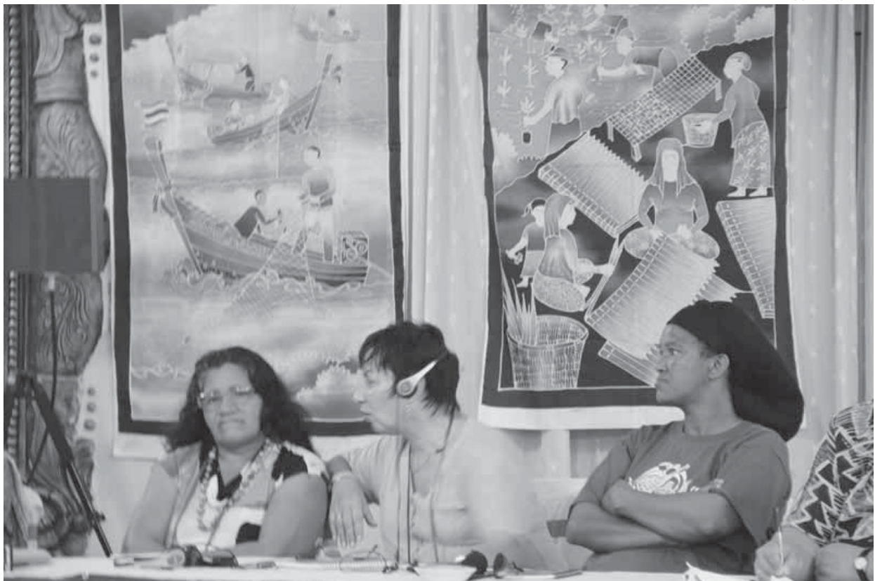
International fisheries instruments, including the FAO Code of Conduct for Responsible Fisheries (CCRF), often neglect gender issues, the workshop was told