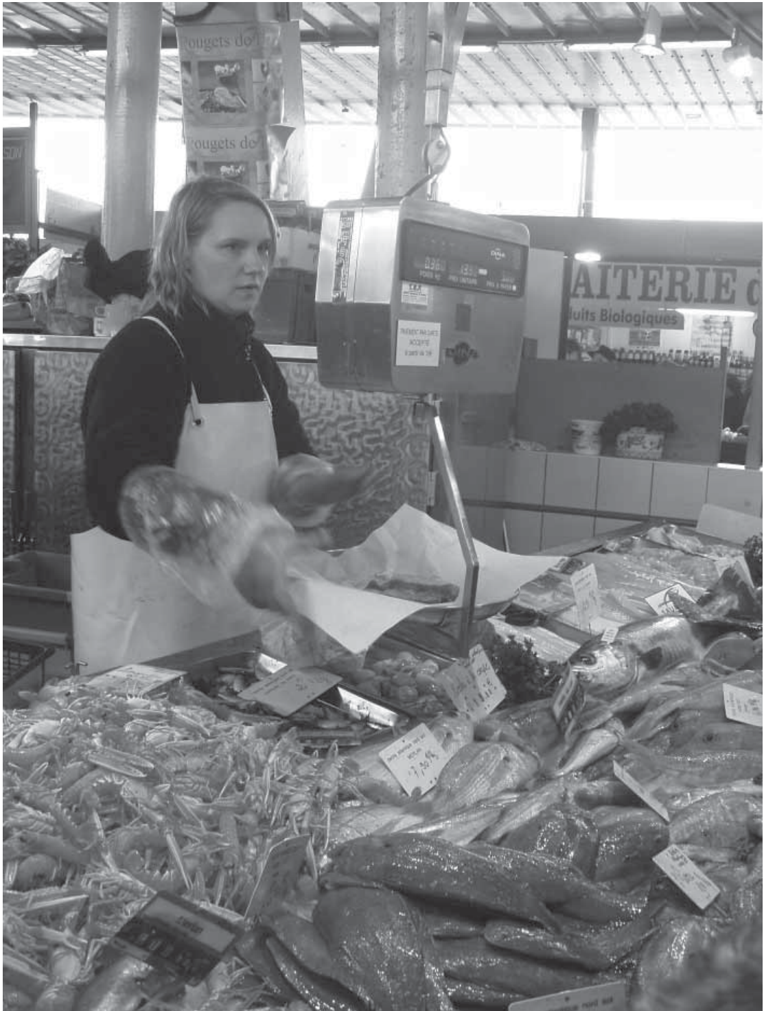
A woman selling fish and assorted seafood at a fish market in Lorient, France