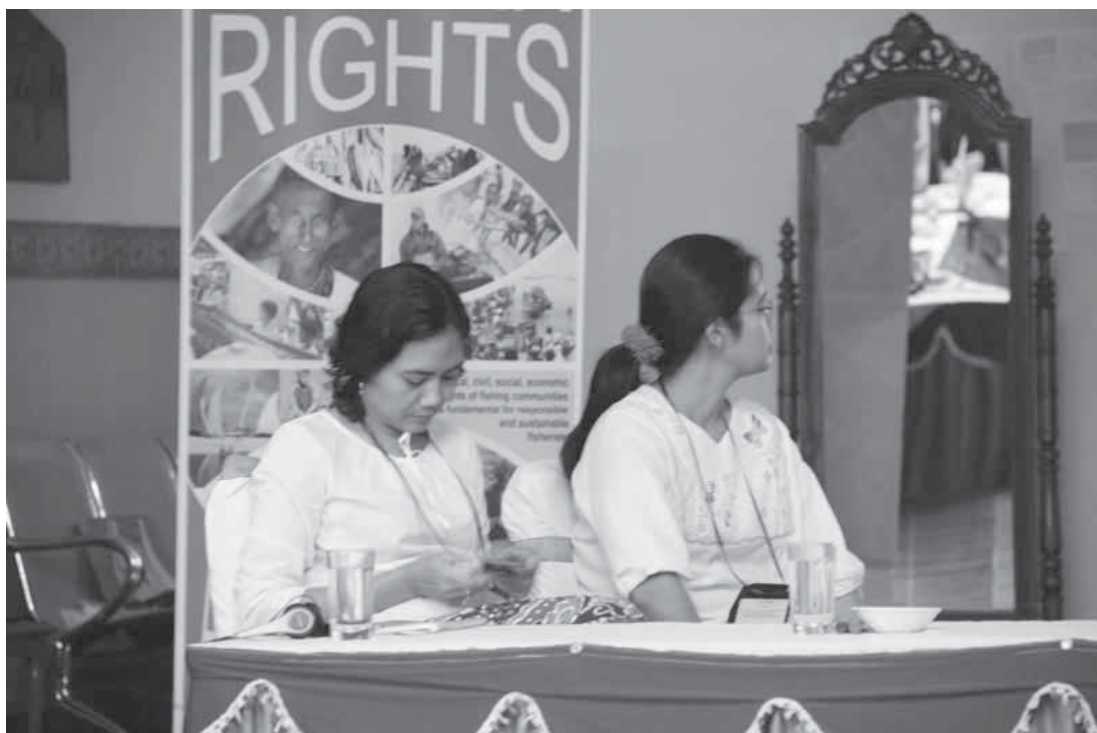
The review of literature pointed to a growing emphasis on a human-rights framework in the discourse on gender issues