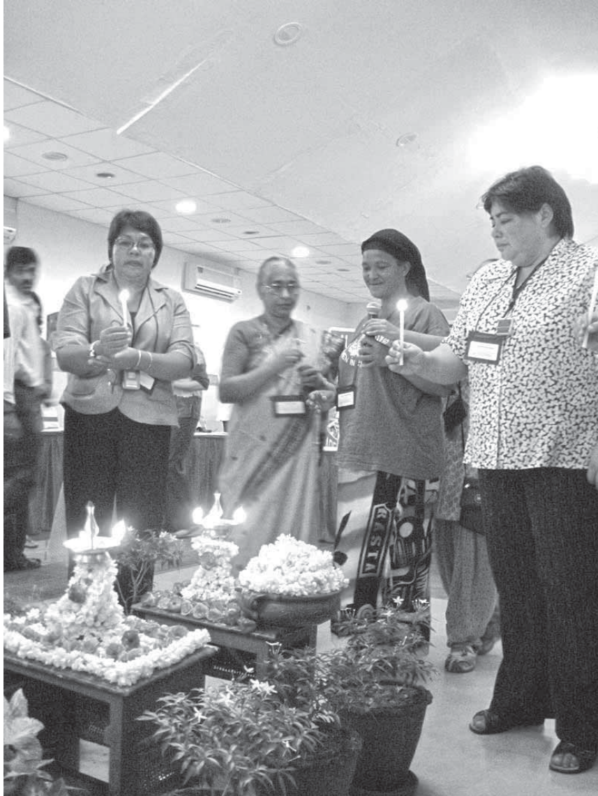
Traditional Indian ceremony of lighting the lamp to inaugurate the Mahabalipuram Workshop