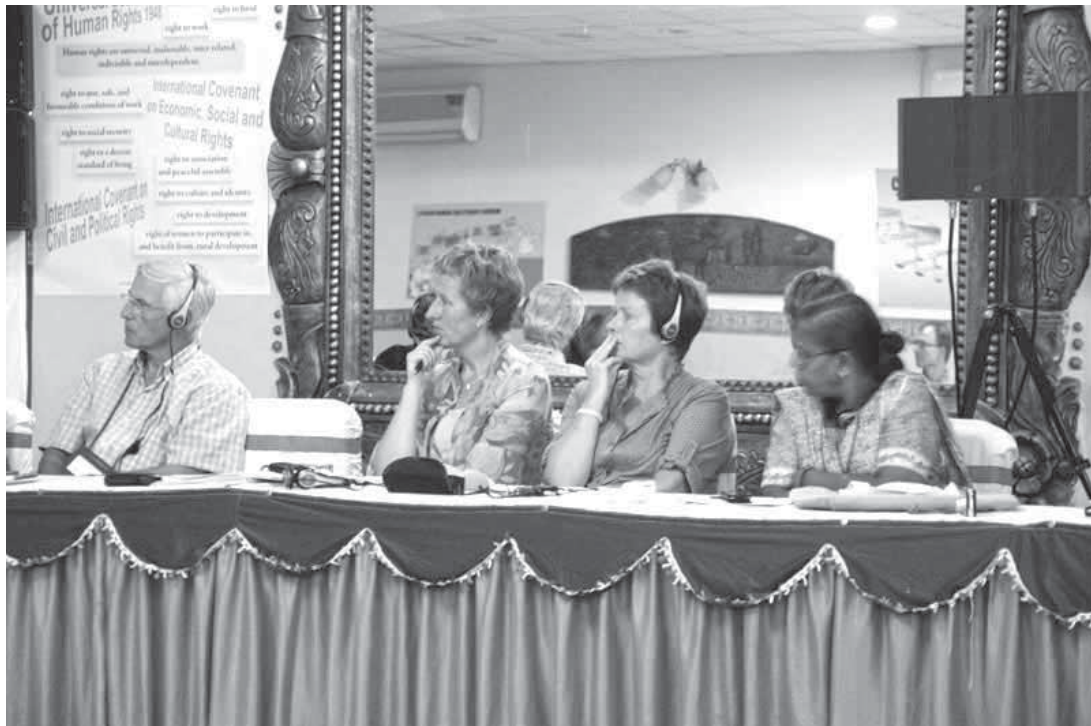
Participants listening to a review of literature, which analyzed the major shifts over the last three decades in the dominant discourse on women in small-scale fisheries