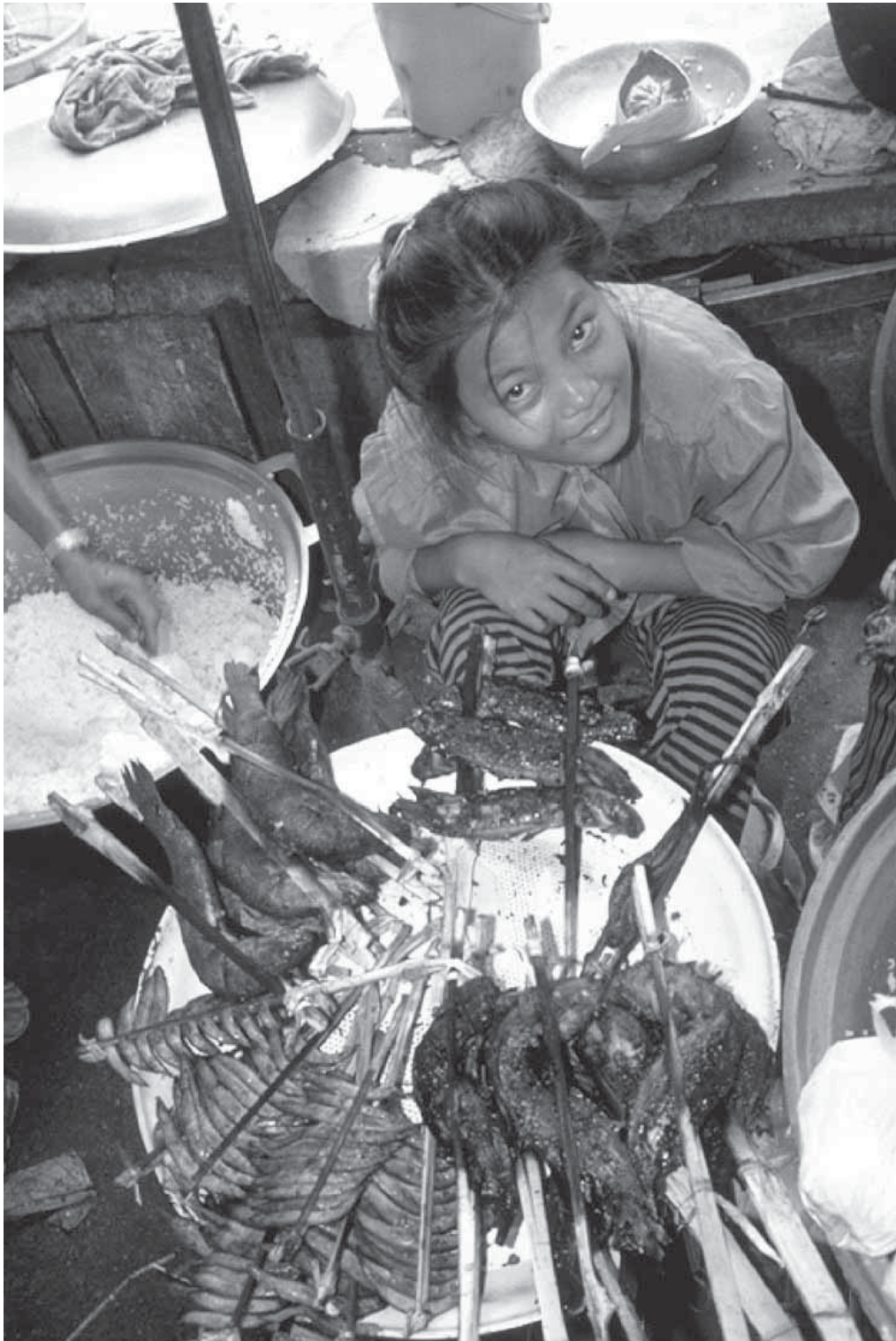
A girl selling smoked and dried fish in a market in Pusan, South Korea