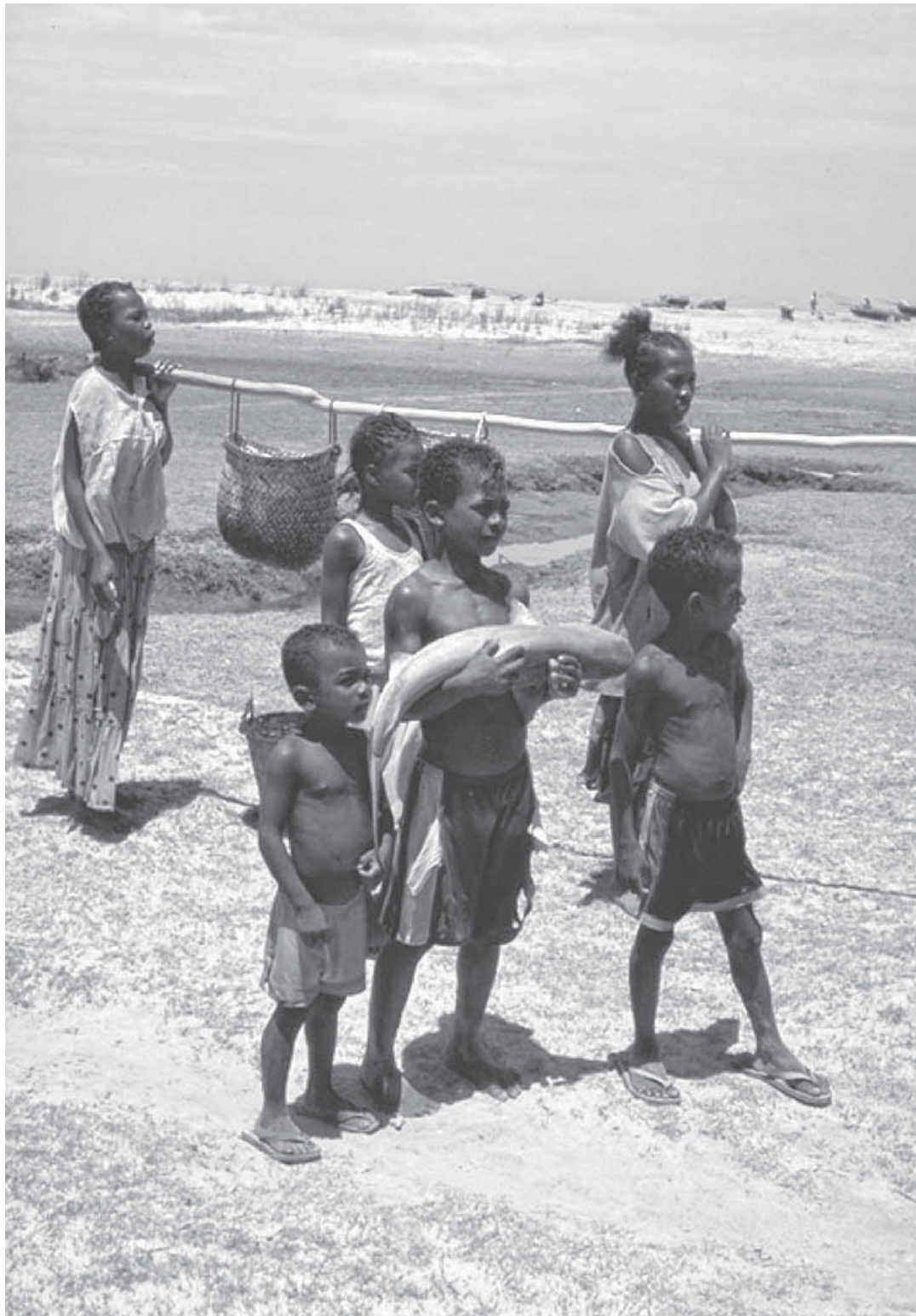
Women and children heading to the Tul market in Madagascar with the day's catch of fish