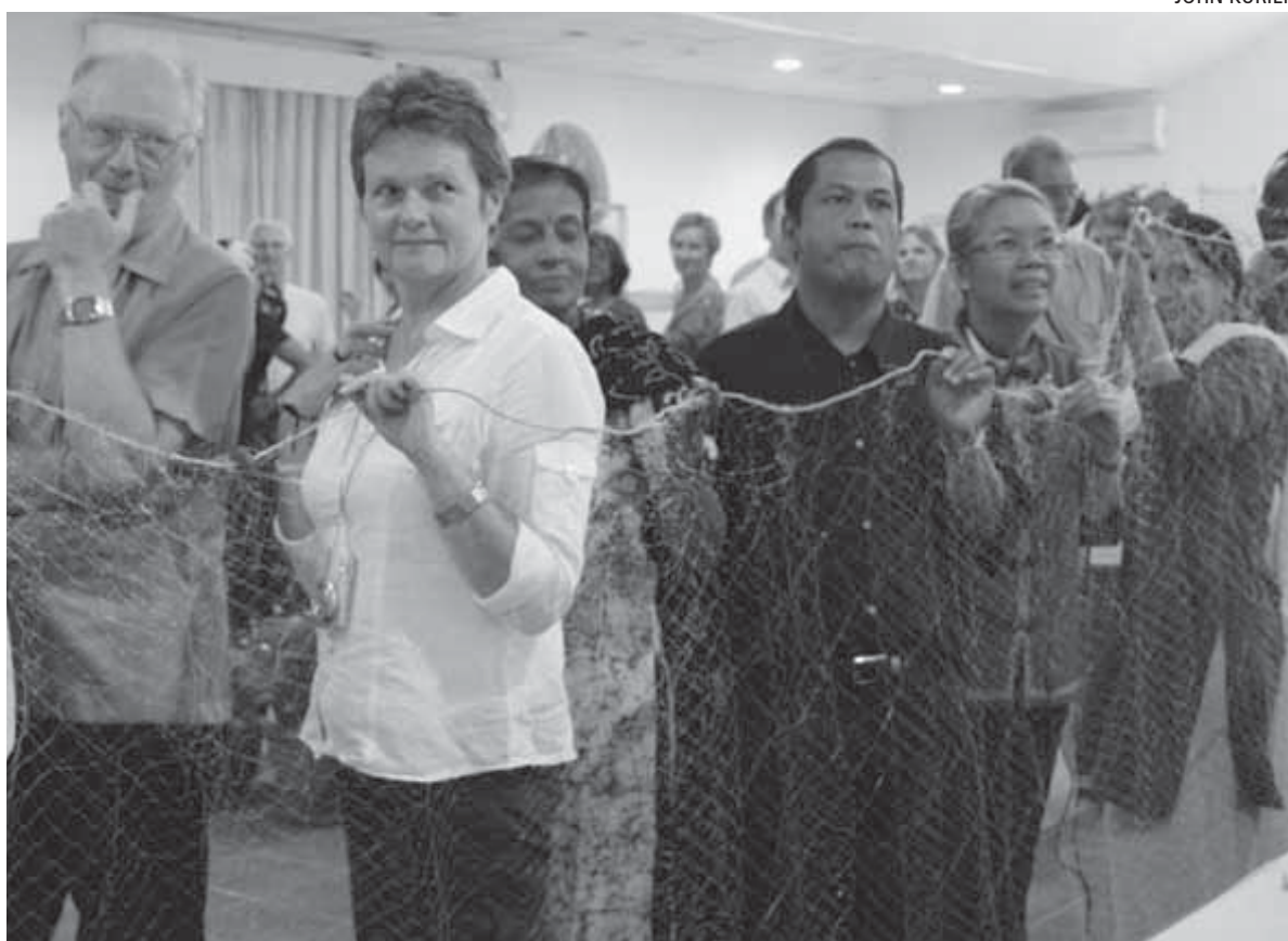
Workshop participants singing a Ghanaian fishing song while holding up a net, symbolizing their solidarity and commitment to take forward common concerns and the “Shared Agenda”