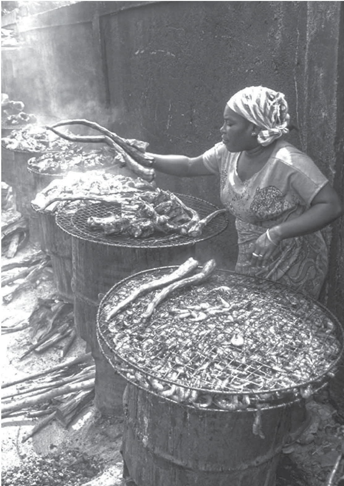
A fisherwoman smoking shrimp at Abidjan on the Ivory Coast