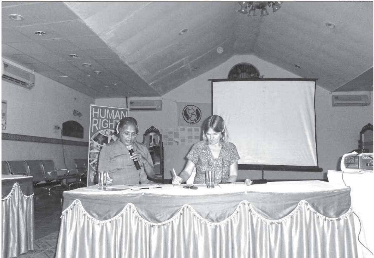
The report of the group discussions were presented to the workshop