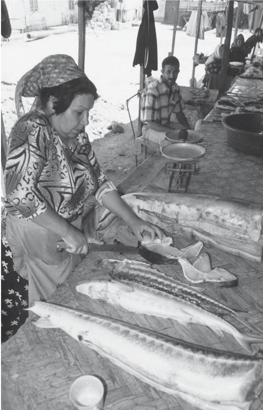
A scene from a sturgeon market in Bakou, Azerbaijan