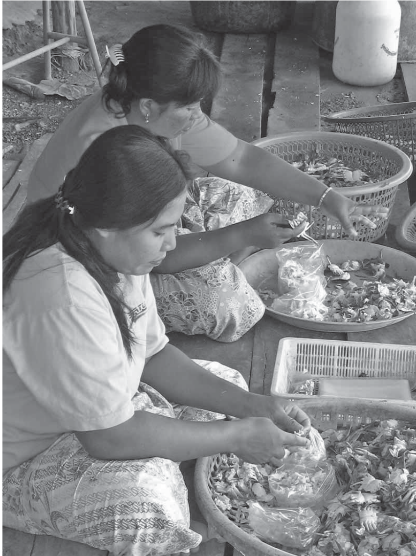
Women cleaning crabs in a fishing village in Trang Province, Thailand