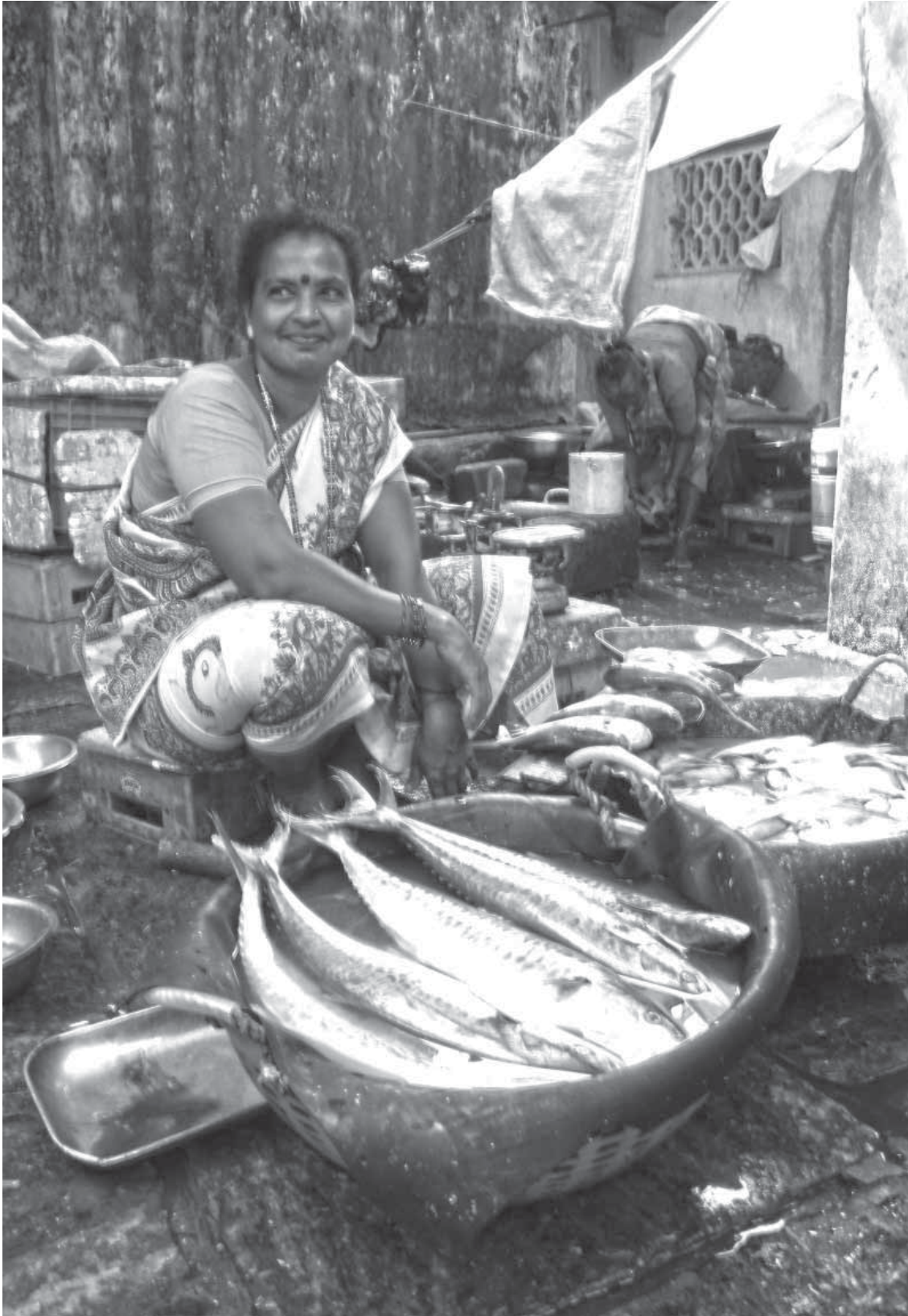
A woman fish vendor at the Udupi fish market in the Indian State of Karnataka