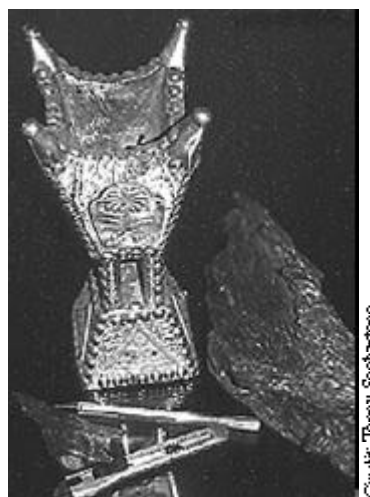
Agarwood incense burner with a piece of Aquilaria wood alongside

Although it may be possible to use healthy Aquilaria wood to make simple ornamental boxes, this wood is typically too light and fibrous (rather like balsa wood) to be suitable for furniture, construction or even carving. Some foresters in India have suggested using Aquilaria wood for constructing tea-boxes (Chakrabarty et al. , 1994). Aquilaria bark was reportedly used for this purpose during the nineteenth century (Heuveling van Beek and Phillips, 1999). There is a considerable number of craft shops offering religious 'agarwood' sculptures, usually Bhuddhist figures. Although a proportion of immature agarwood is used in this trade, most statues are not made with agarwood, owing to its soft and flaky properties, which make it unsuitable for carving. Instead, tropical hardwoods are treated to resemble agarwood. The wood