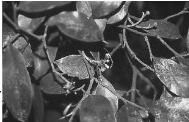
Leaves of Aquilaria malaccensis tree

Aquilaria malaccensis is one of 15 tree species in the Indomalayan genus Aquilaria , family Thymelaeaceae, (Mabberley, 1997). It is a large evergreen tree growing over 15-30 m tall and 1.5-2.5 m in diameter, and has white flowers (Chakrabarty et al. , 1994). A. malaccensis and other species in the genus Aquilaria sometimes produce resin-impregnated heartwood that is fragrant and highly valuable. There are many names for this resinous wood, including agar, agarwood, aloeswood, eaglewood, gaharu and kalamabak ,