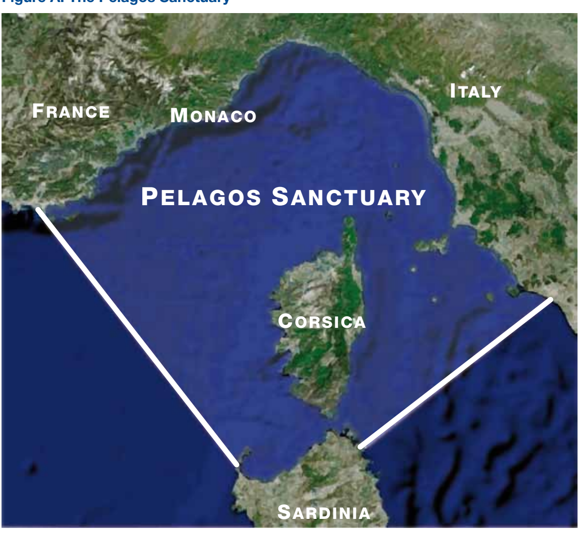
Figure A: The Pelagos Sanctuary