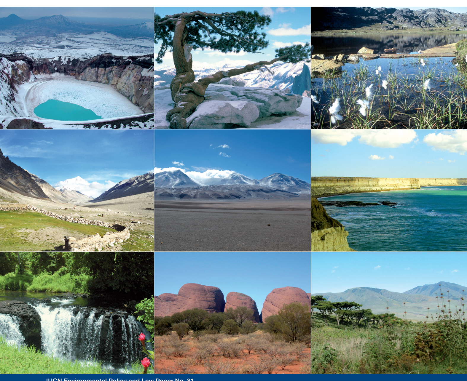
IUCN Environmental Policy and Law Paper No. 81