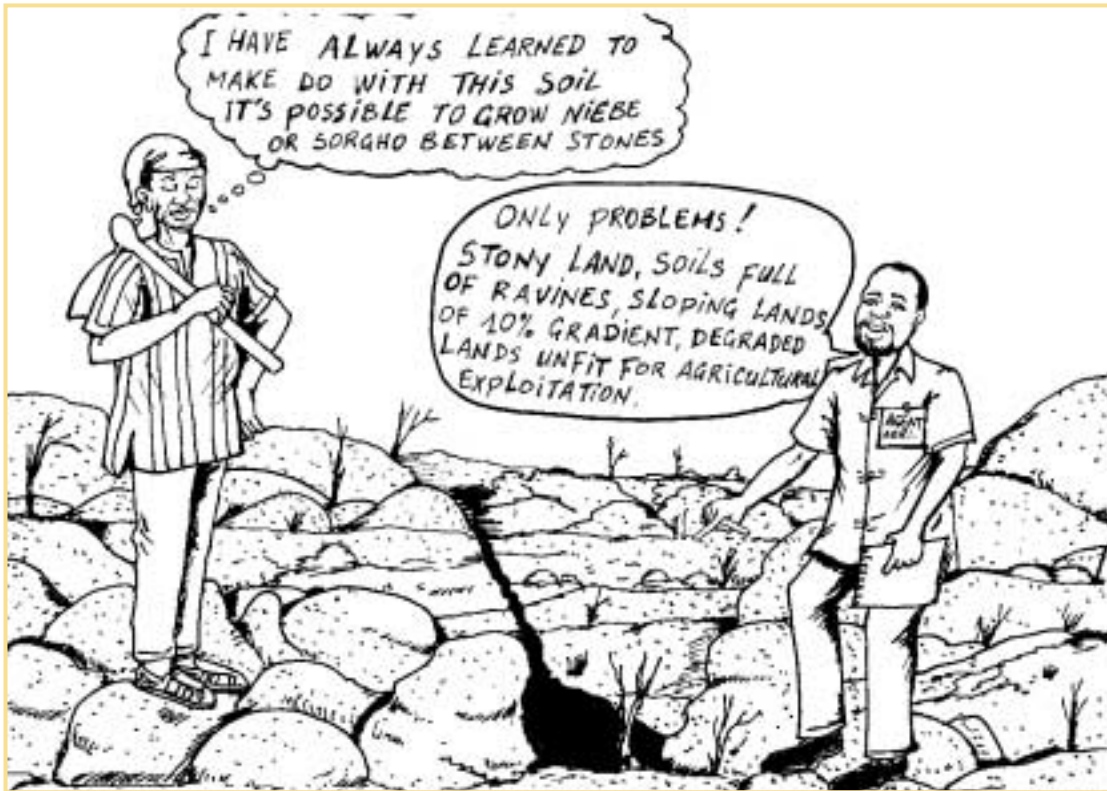
Difference in perceptions between communities and technicians

understanding and taking the social conditions into account. It was only after this that the interventions were reconsidered through a set of innovative approaches and other arrangements such as integrated programmes and land management based on the promotion and the participation of the local populations.