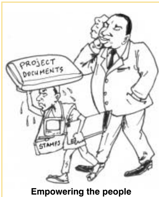
Empowering the people

The participatory approach arouses a voluntary and spontaneous support from the populations in a sustainable and autonomous development perspective. Participatory approaches stress the involvement of the populations in all the phase of the project implementation. They put the beneficiary communities at the centre of the development process by empowering them. The development perspectives (see Box 4) of these approaches are couched in the following concepts: