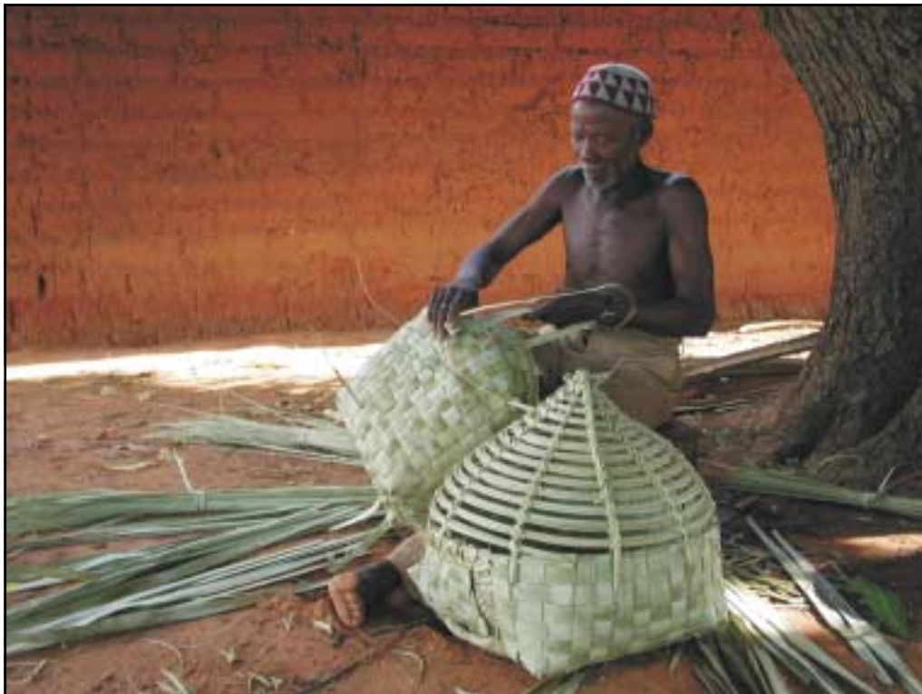
Exploiting plant resources