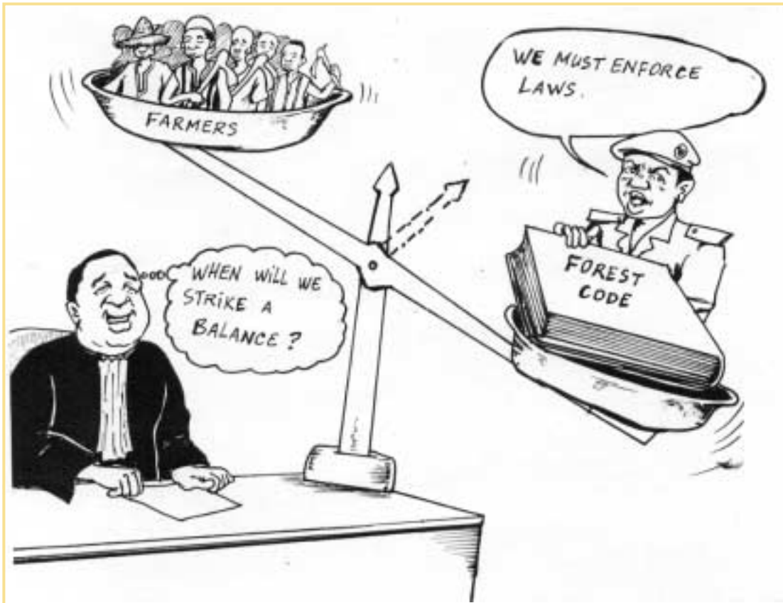
Legitimacy and legality: substitution of a negotiated order for an imposed order