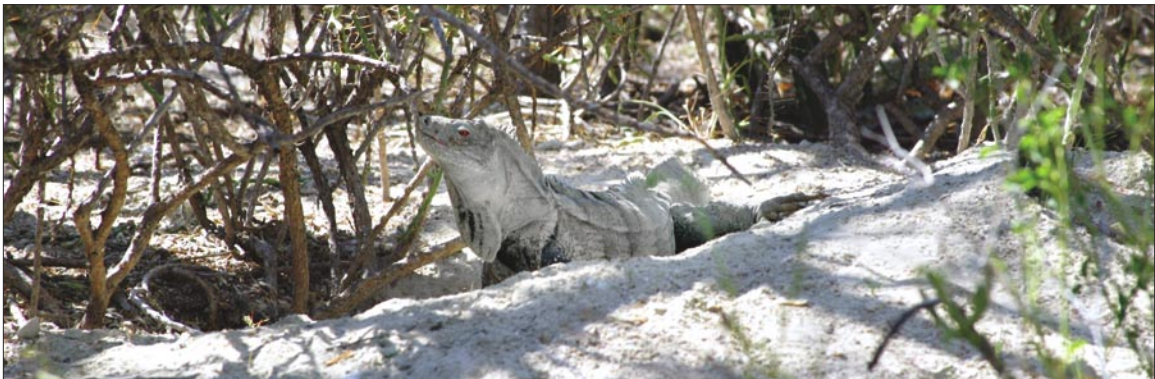
An adult male Ricord's iguana outside its burrow on Isla Cabritos