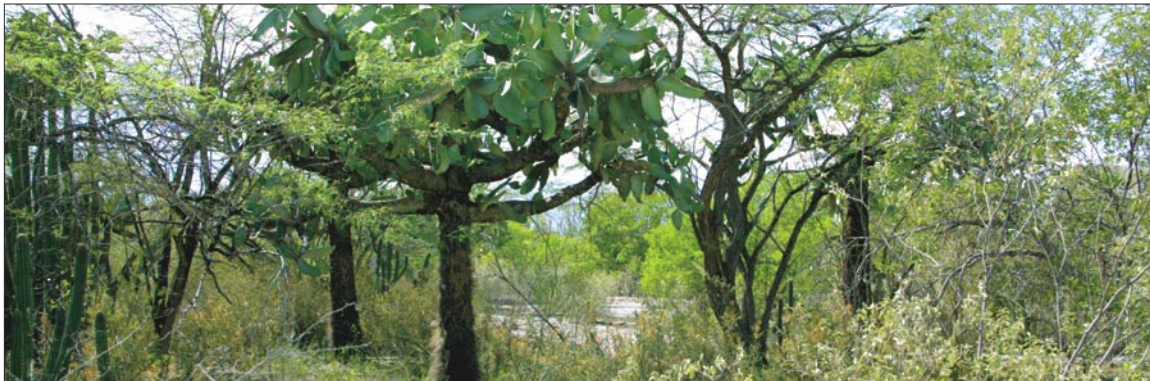
Habitat on Isla Cabritos