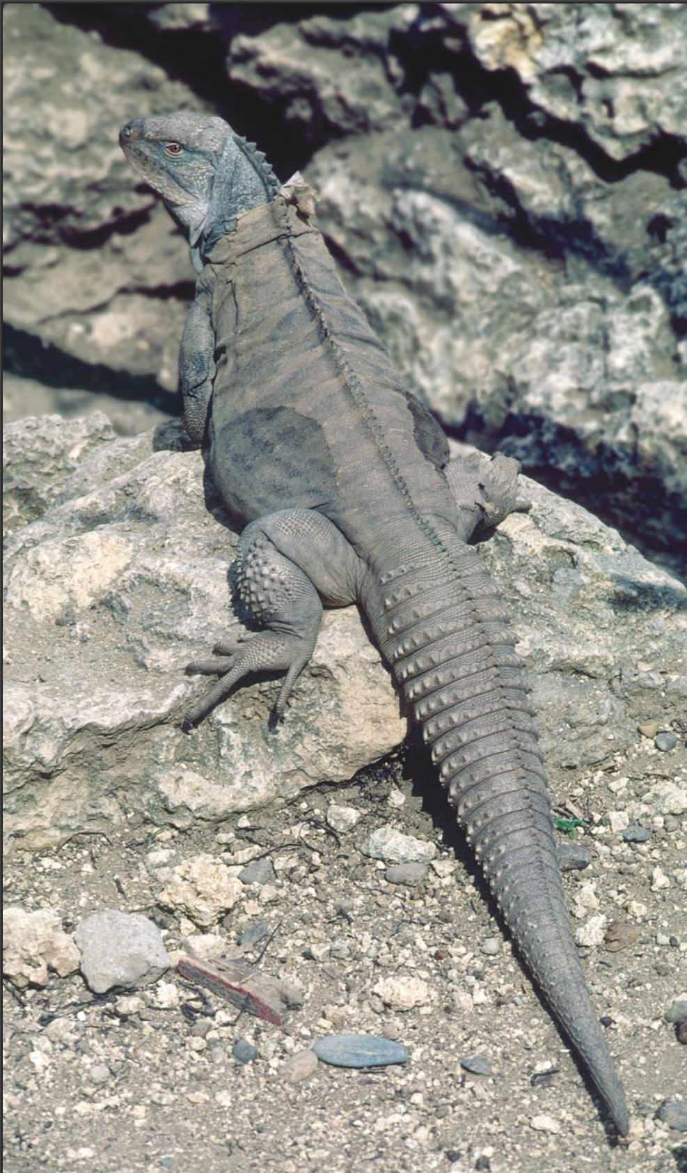
Female Ricord's iguana ( Cyclura ricordii )