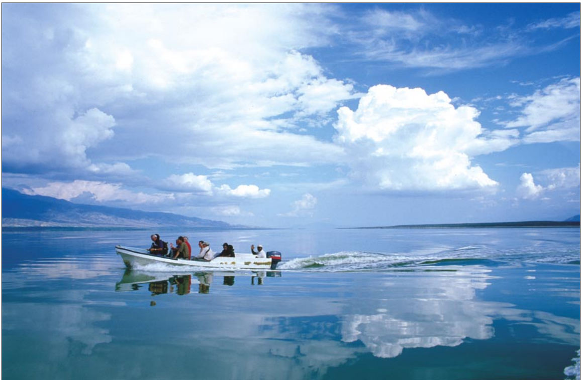
Isla Cabritos field trip participants returning by boat on Lago Enriqueillo