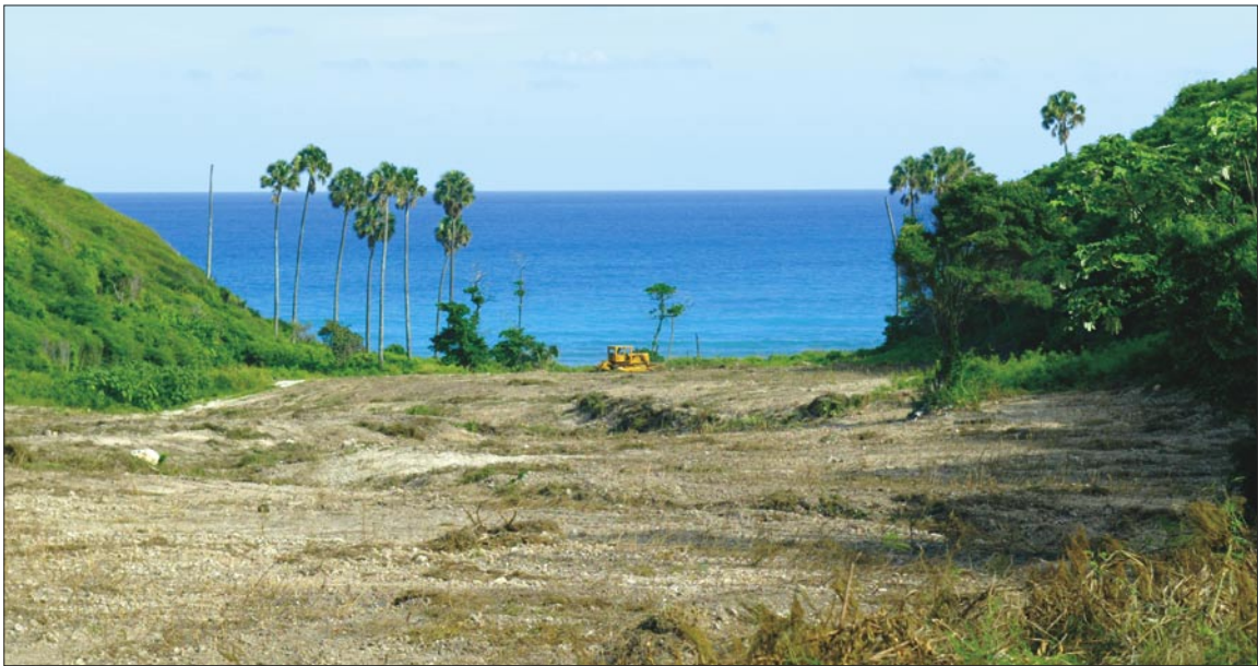
Land-clearing, lower Barahona Peninsula within Ricord's iguana range

Puerto Rico DNRE, P.O. Box 9066600, San Juan, Puerto Rico 00906 Phone: (787) 724-8774 x2237, Fax: (787) 724-0365 Email: miguelag@umich.edu