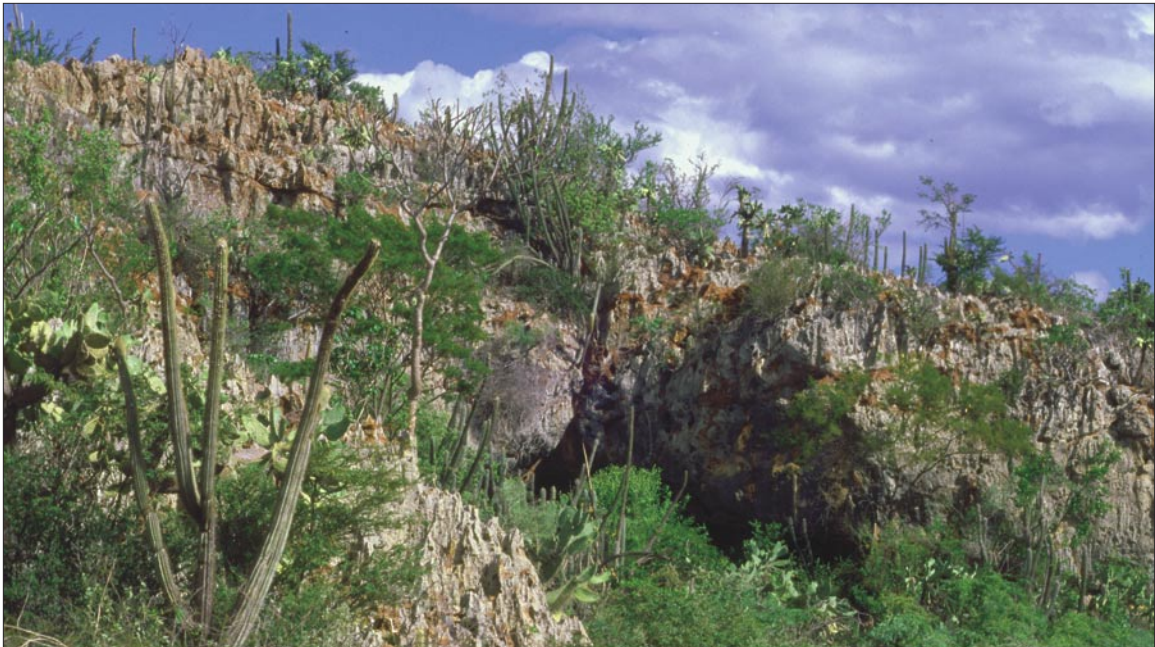
Parque Nacional Jaragua - Cyclura ricordii and Cyclura c. cornuta habitat