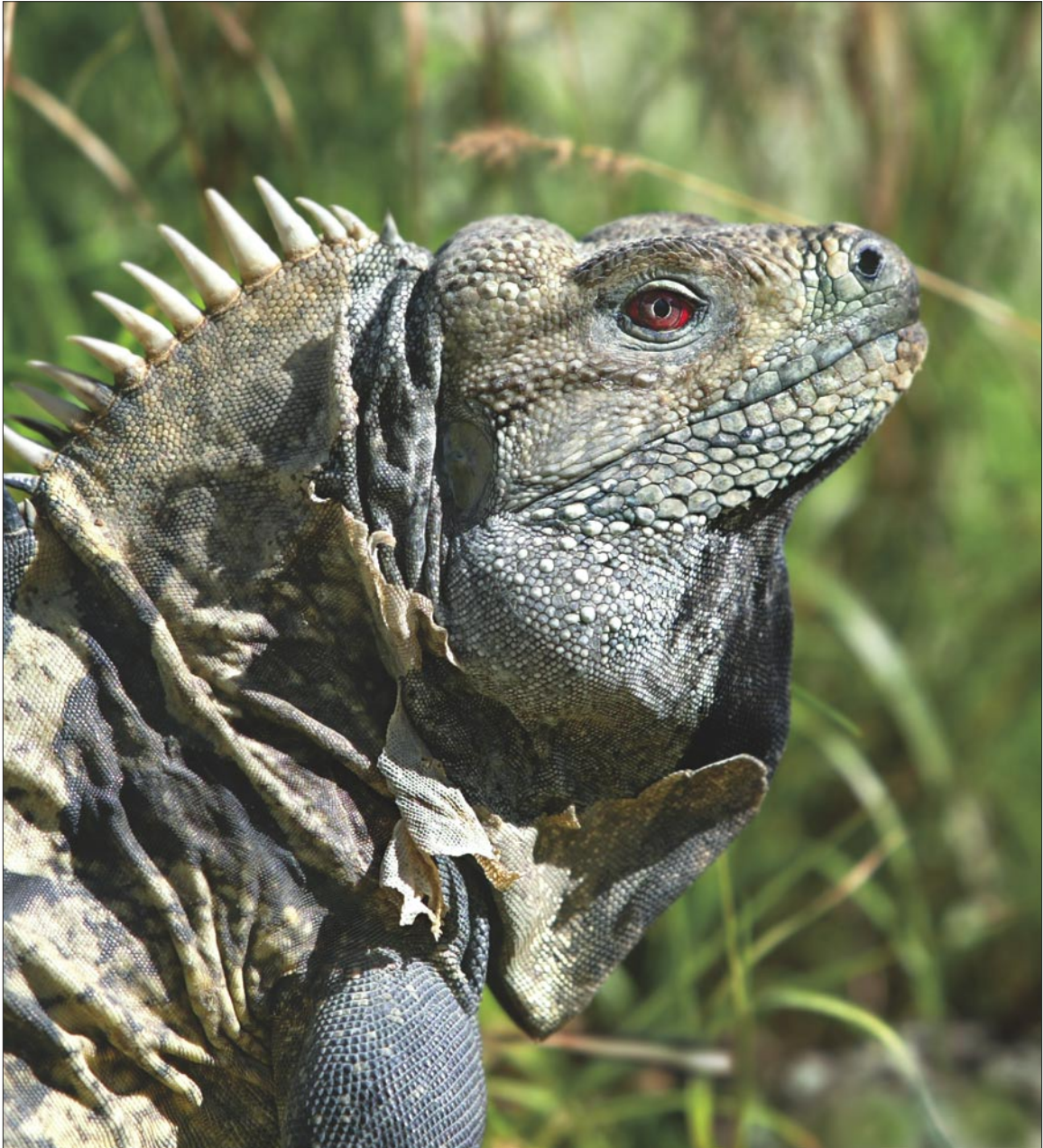
Male Ricord's iguana ( Cyclura ricordii )

“To ensure the long-term survival of Ricord’s iguana throughout its natural range.”