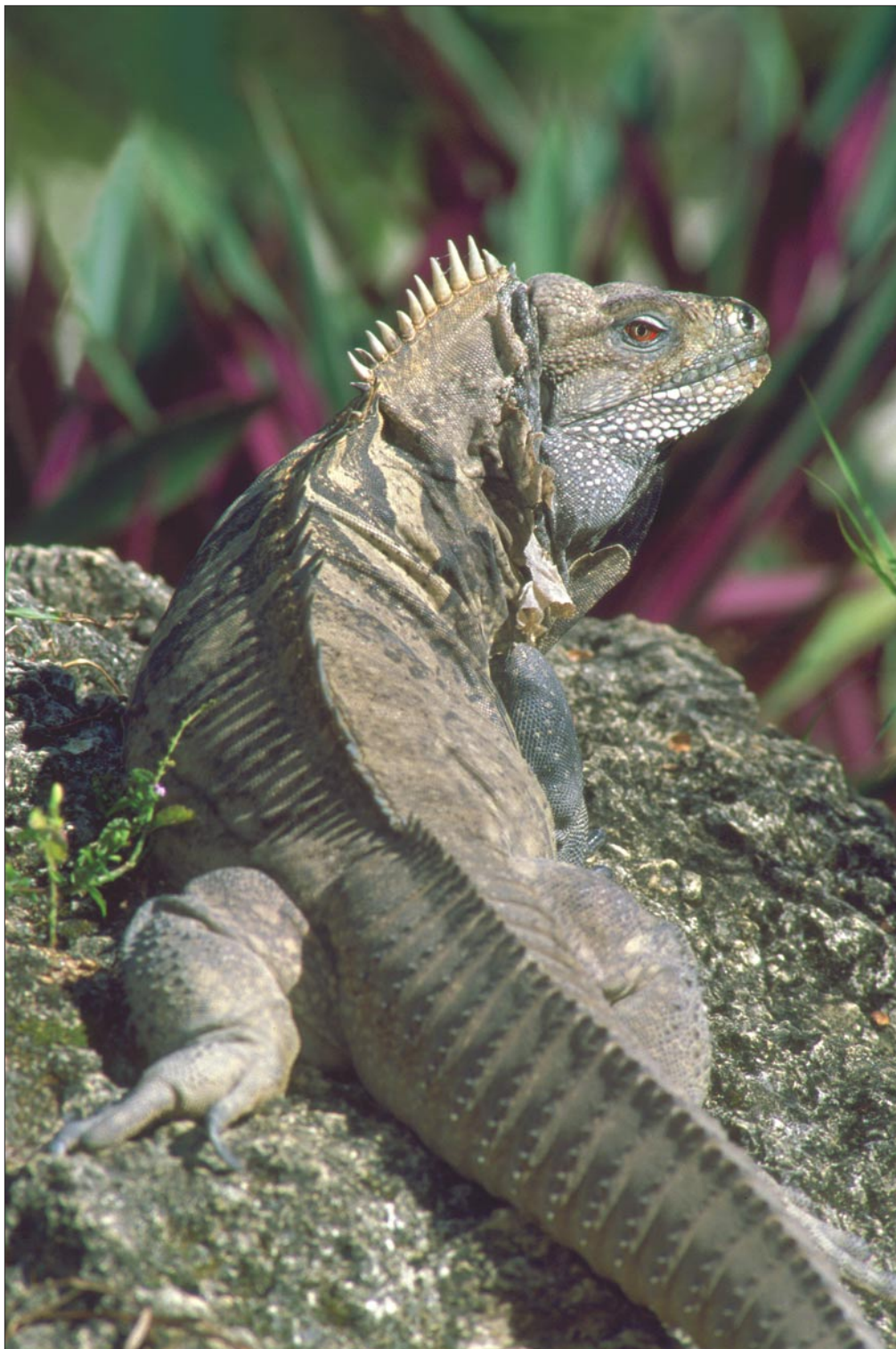
Male Ricord's iguana ( Cyclura ricordii )