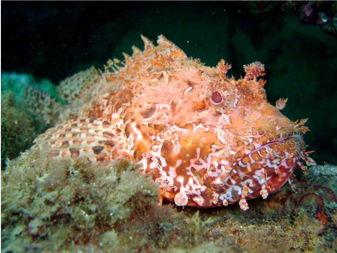
A scorpion fish (Scorpaenidae) in the Mediterranean sea, near Escala, Spain