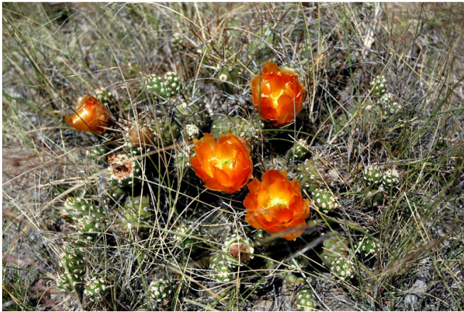
Photo 8.1 A cactus flower on Peninsula Valdès, Argentina

Within the framework of the SCS, Actions fall below Objectives (see Figure 2.1). However, because Objectives can be rather broad in their scope, whereas Actions are often most useful if very specifically defined, it is helpful to group Actions under a number of Objective Targets associated with each Objective (see Table 8.1). Each of the Actions proposed should be necessary to achieve the Objective Target with which it is associated. Additionally, the Actions listed under an Objective Target should, together, be