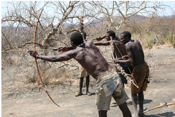
Photo 5.1 Hadzabe Bushmen hunting, Lake Eyasi region, Tanzania

This subsection answers the question: Why save the species? It should summarise the values of the species to people, including ecosystem services connected to the species (such as pollination and seed dispersal), human consumptive (for example, food and decoration) and non-consumptive (for example, tourism) uses of the species, and important cultural and spiritual values (such as cultural symbolism and group-identity), both within the species' geographic range and outside that range (see Chapter 10). The subsection should also describe ecosystem functionality that is not of direct benefit to people, but important for how the species acts in nature, including predator-prey dynamics, competition, mutualisms, and roles in creating, changing, or destroying habitat (for example, beavers creating dams, elephants' destruction of trees).