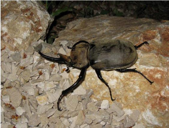
Photo 3.1 A rhinoceros beetle ( Dynastes sp. ) in Nosara, Costa Rica

However, the details of conservation planning and the emphasis, nature, and level of detail for the various components of the strategy may be quite different.