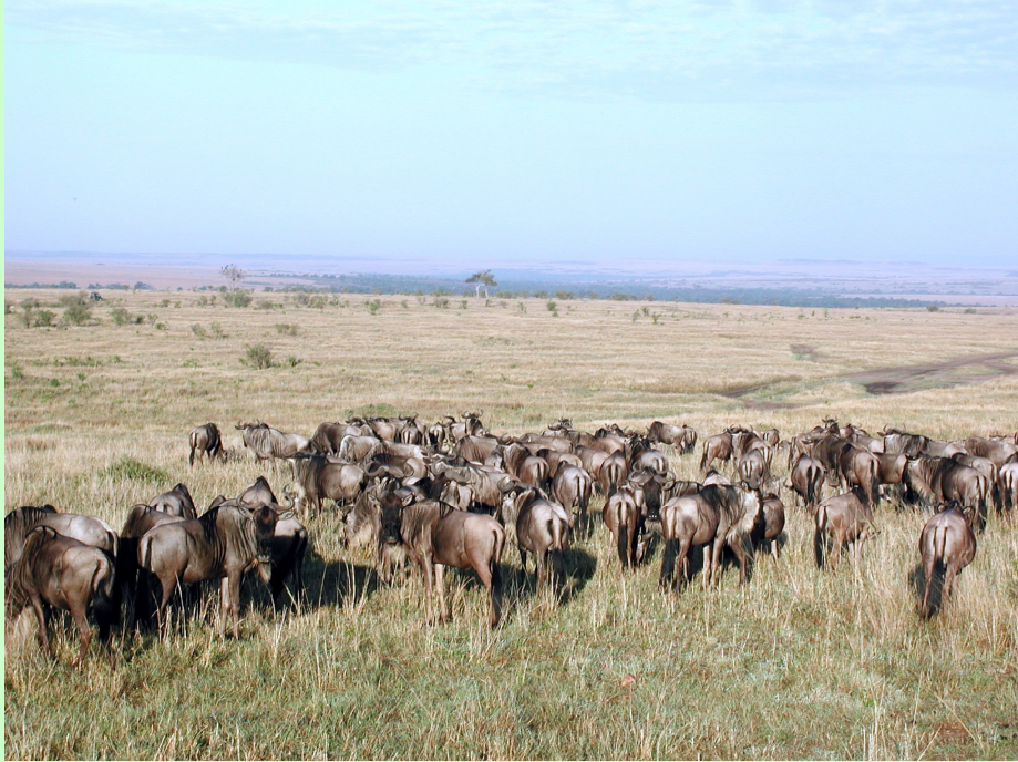
Photo 7.2 Wildebeest ( Connochaetes taurinus) migration in the Masai Mara, Kenya

Like many other aspects of strategic planning for species conservation, threat analyses are likely to be most useful when conducted by interdisciplinary teams of stakeholders with a diverse array of expertise and experience. This should ensure that all of the key threats are identified by the analysis.