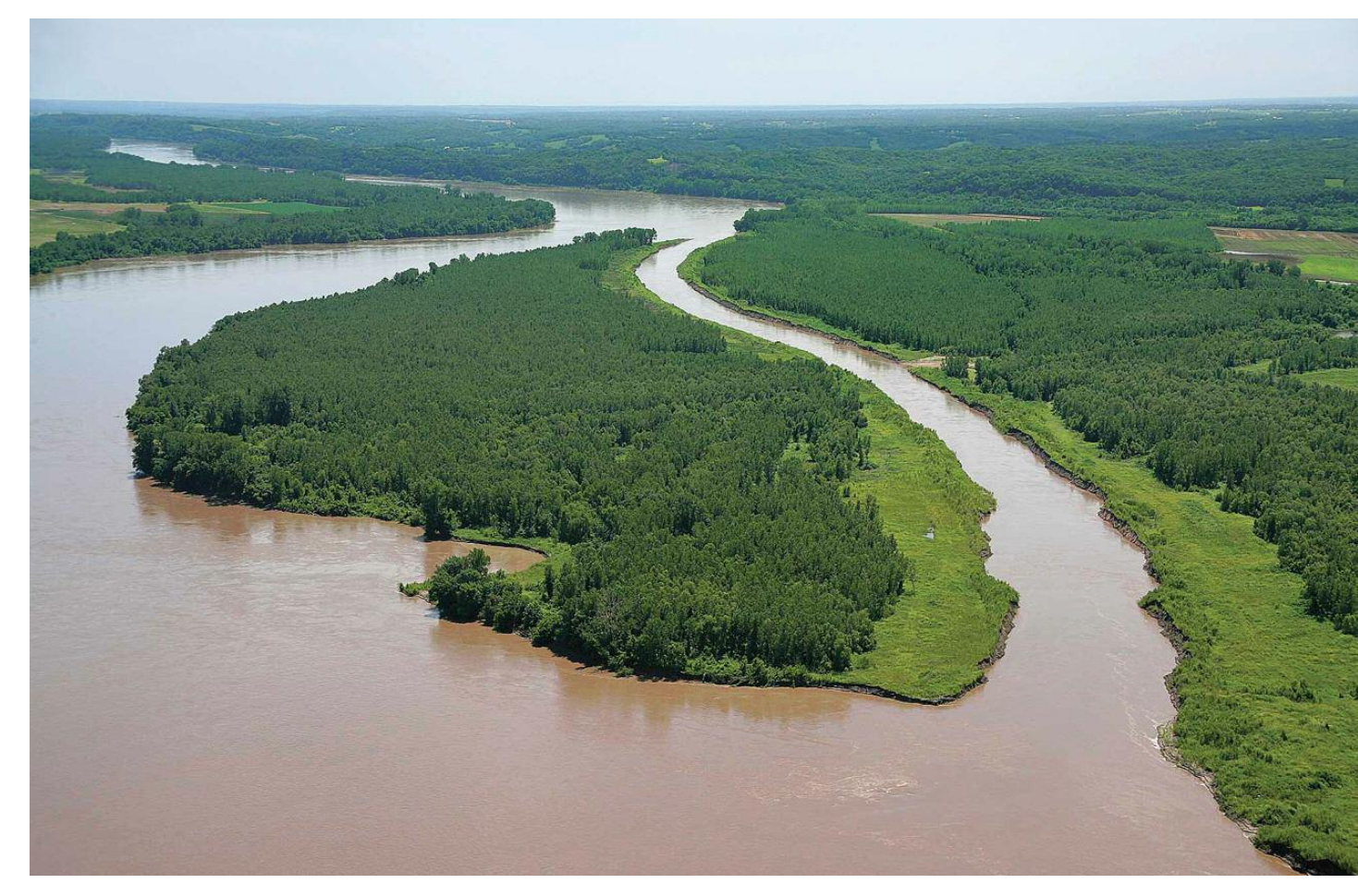
The Volta River