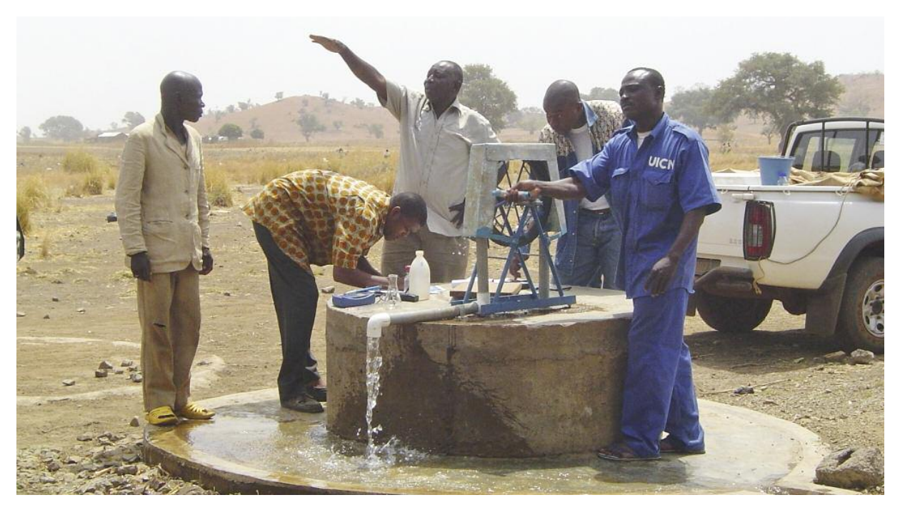
Water quality tests in the Volta Basin

WANI and partners provided support for assessments of water quantity and quality discharge and to rehabilitate gauging stations. Fourteen samples comprising 11 well water and 3 river water were collected from the PAGEV pilot zone in Ghana and Burkina Faso and analyzed to categorise the quality of water from wells provided to communities by the PAGEV Project and of selected hotspots along the river channel.