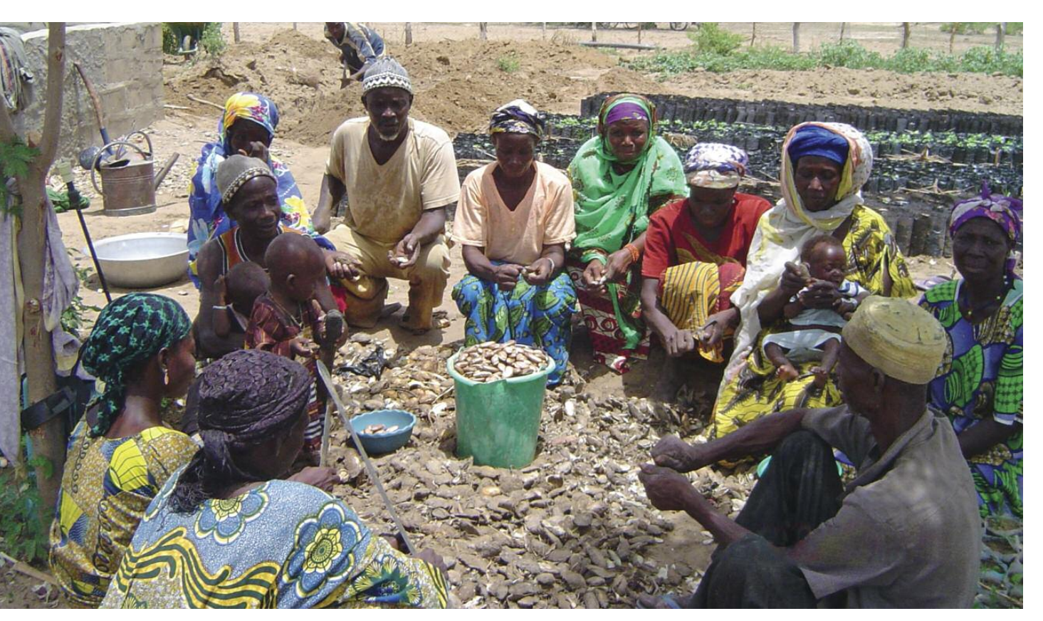
Community preparation session for reforestation activities

1. Alignment of activities with national priorities and linkages with government policy processes are needed for larger-scale impacts. When national interests are positioned with regional initiatives such as basin authorities, which have the political hardware and infrastructure to support transboundary collaboration, water resources governance can become a reality at multiple scales and across national boundaries.