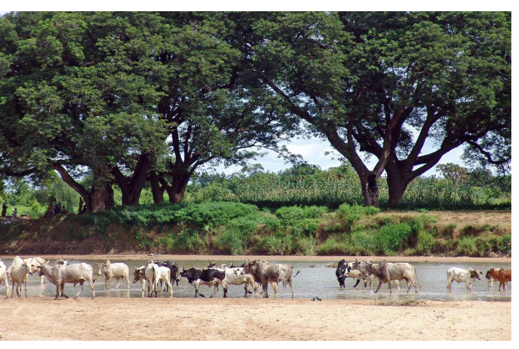
The border between Ghana and Burkina Faso on a tributary of the Volta River in dry season – the river is the border

Burkina-Ghana 'Joint Technical Committee on IWRM' (JTC-IWRM). This initiative was launched in 2005 with the aim of providing assistance to the two States on the development and management of shared water resources in the basin. In 2006, national validation workshops were convened in each country to ensure input was received from government agencies, NGOs and civil society groups.