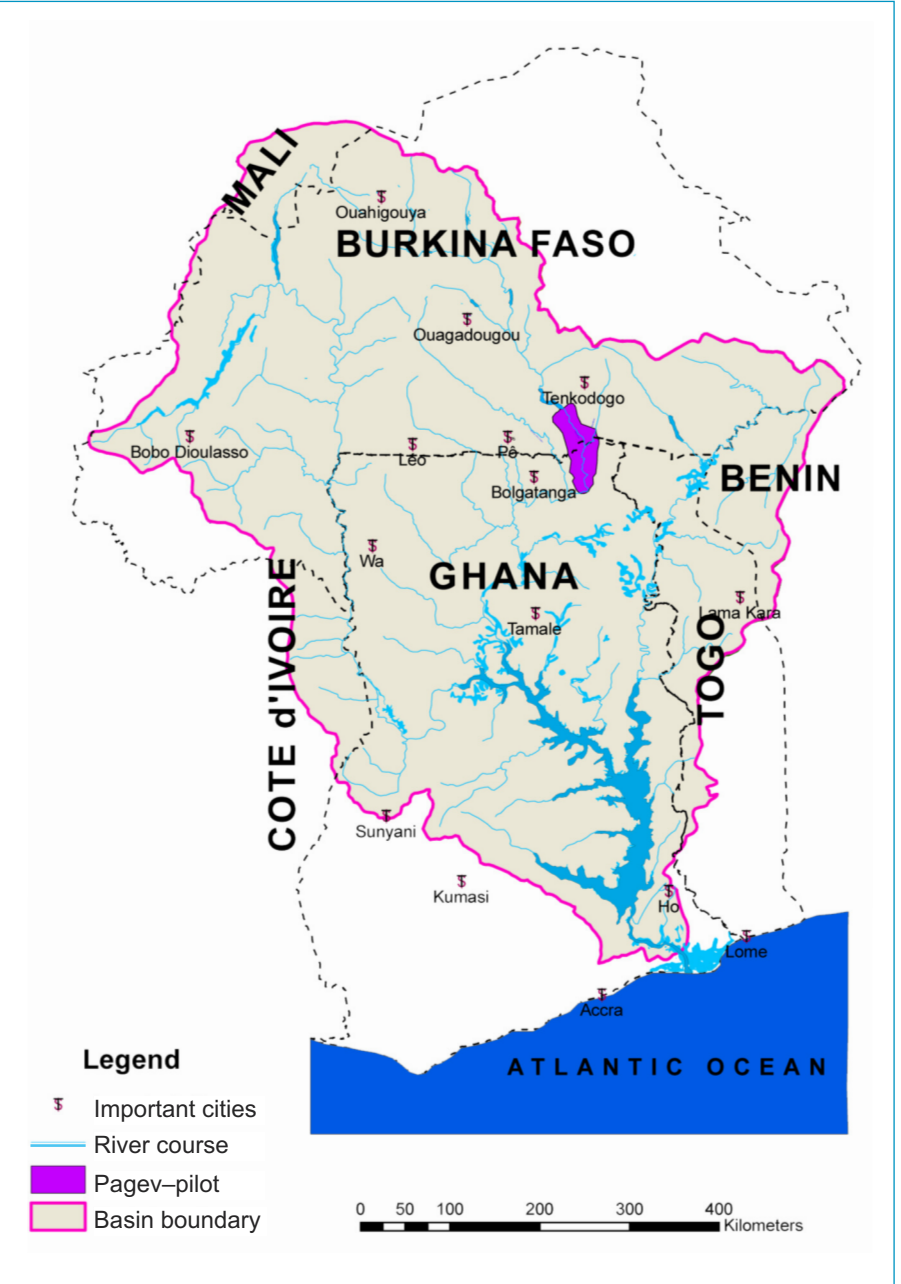
Figure 1. Map of the Volta River Basin

About 85% of the Volta basin is located in Burkina Faso and Ghana while Togo, Benin, Cote d'Ivoire and Mali share the remaining 15%. The basin is divided into four major sub-basins: the Black Volta, the White Volta, the Oti and the Lower Volta. The Volta Basin is home to nearly 19 million people who depend directly or indirectly on the resources of the river. Therefore the Volta Basin is an important asset for the development of the riparian countries.