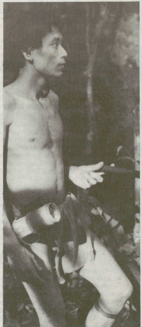
Nomadic Penan from Mulu hunting with blowpipe and poisoned darts, carried in a bamboo quiver.