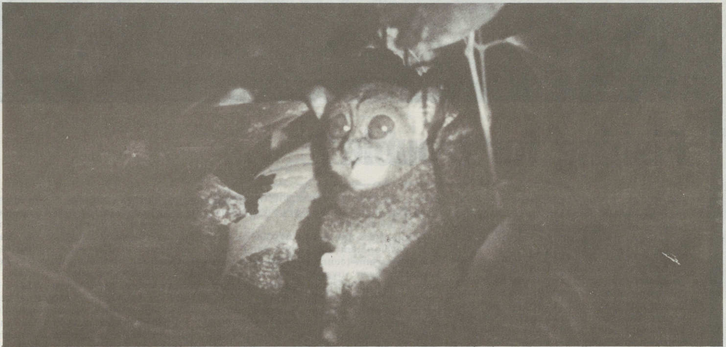
The nocturnal and largely insectivorous spectral tarsier is a primitive primate resembling those of the early Eocene period 50 million years ago. Its ability to turn its head through 180 degrees gives it a local reputation for evil powers. Few were seen in the park.