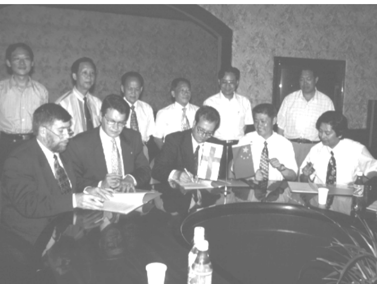
Signing a work plan of cooperation between protected areas in Hunan Province (China) and Finland.

these initiatives can be called “programmes” because they go beyond individual, spontaneous park partnerships or one-off visits to protected areas.