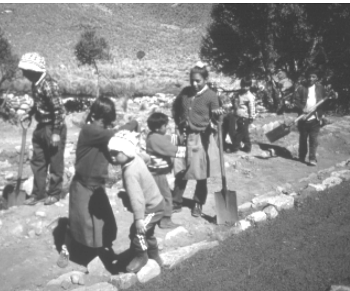
Schoolboys in Quecocochoa on a programme for environmental education.

intercultural relations in environmental education and sustainable development. This has developed into a relationship of solidarity and reciprocal cooperation. The parents of the Italian children joined in to send materials to the little high-mountain school in Peru, the Park Rangers have been active in trying to find resources to improve the structures and equipment, and the Italian NGO Operazione Mato Grosso (already present in the area) formed a logistical and financial base after having already built a mountain hut in the Peruvian park.