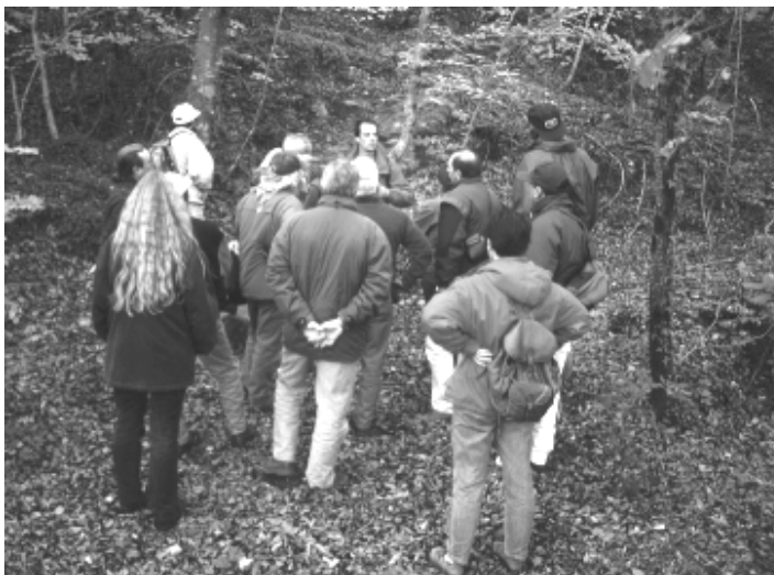
Practical activity during a field trip to a natural protected area.

experience of the problems that protected areas nowadays confront, and their communication skills. They came from a variety of backgrounds: public administration, universities, private enterprise, outside consultancies and so forth. Their lectures tended to be interspersed with statements from participants and concentrated on new and striking features, offering different perspectives and helping to clarify thinking and bring to the fore the topics most on participants' minds. On occasion the lecturers suggested new working methods which gave a much fuller, more illuminating picture of the problems under discussion. They then joined in the ensuing discussions; this afforded an opportunity to fashion tailor-made solutions to the individual problems of some protected areas.