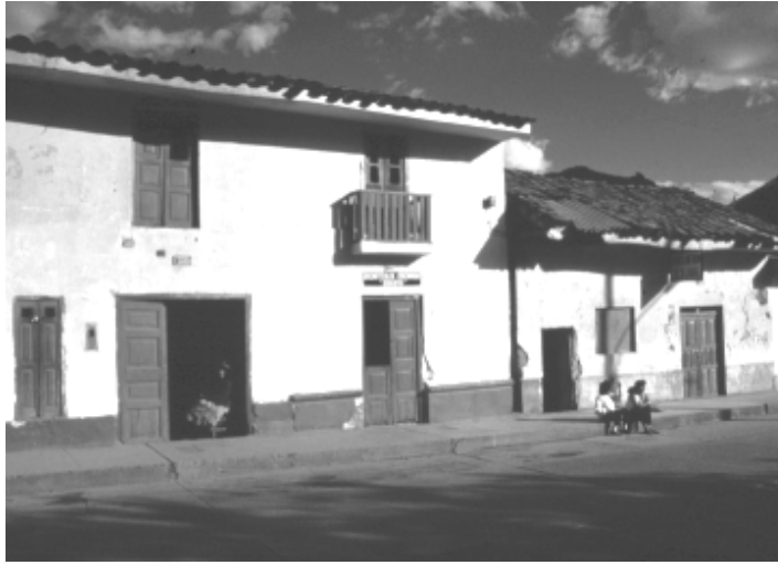
Traditional homes in Huacos.

The involvement in EUROPARC's Partnership and Exchange Programme was crucial for starting the partnership. The Programme not only helped to identify a suitable partner, it also provided coordination and logistical support for exchange activities. The Programme provided technical assistance in drafting the Twinning Agreement and the triennial Working Plan. At the end of 1996, due to the different administrative levels and powers involved on the Peruvian and Italian side (national park authority vs. regional park authority), the Italian Ministry of Foreign Affairs denied the authorisation to proceed with the twinning agreement following the application of the Piedmont Region earlier that year. EUROPARC's Partnership & Exchange Programme helped to negotiate a park-to-park twinning agreement in line with legal provisions and supported by the competent authorities, which was finally signed on 16 June 1997.