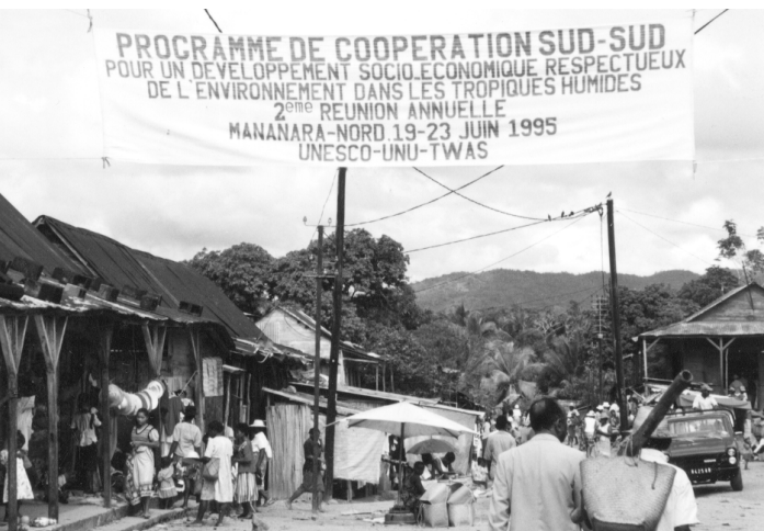
South-South cooperation meeting in Mananara-Nord, Madagascar. Announcement of the meeting throughout the Biosphere Reserve. Photo: M. Clüsener-Godt, UNESCO, 1995.

Province in China, a field trip in the Xishuangbanna Biosphere Reserve was organised. This meeting brought together more than 100 participants from more than 20 countries throughout the humid tropics of the world, to discuss “Multiple Resource and Land Use Planning in Biosphere Reserves and Similar Managed Areas as Subject for Ecodevelopment”. The main topics of the workshop were the multiple resource use and integrated land use planning in Biosphere Reserves and similar managed areas with the participation of local population as a subject for ecodevelopment. Furthermore, the exchange of experience of land tenures and the analysis of different land use and land cover by using similar crops and their relation to environmental change in the humid Tropics were discussed. A special issue of the South-South Perspectives (No. 5) has been prepared on this workshop.