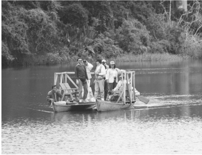
A field visit during a regional training course in the Amazon; an activity of the Network on National Parks.

The procedure normally used in these international meetings begins with the preparation of a national report by each country prior to the meeting, based on a