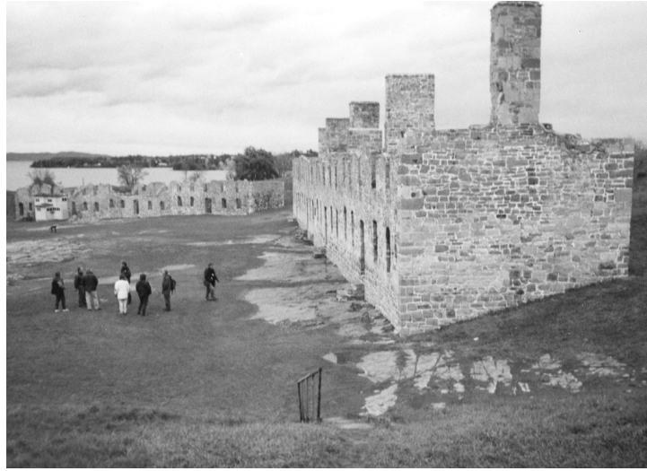
The 1999 Western Champlain Valley Exchange Team visited Fort Frederic, part of the 2.5 million ha Adirondack Park.

A second team came to the area in 1999 – making the Boquet Valley the first community to host two Exchanges. The Champlain Valley Heritage Network (CVHN), an organisation formed as a result of the recommendations in 1991, played a major role in 1999. CVHN is dedicated to fostering sustainable economic development based on the Valley’s cultural and natural resources. It had begun implementing a number of ideas from the previous Exchange, especially promoting nature and agriculture-based tourism. It hoped that a return Exchange would provide a “check up” on the focus of its activities and help generate new energy and involvement. The 1999 Team observed that while there had been progress the area still lacked a strong tourism identity. They were also struck by the amount of activity that had taken place since the last Exchange around Lake Champlain on the area’s eastern edge. With an area of 112,700 ha it is the sixth largest lake in the USA. It has also been called the most historically significant lake in the country. Activity included studies by the US Environmental Protection Agency focusing on water quality and scenic by-ways, consideration by the US National Park Service to designate the lake as a National Heritage Corridor and a suggestion that a major festival be developed in 2008 to mark the 400th anniversary of Samuel D. Champlain’s discovery of the lake. The community had also realised that the Lake Champlain Marine Heritage Museum, located across