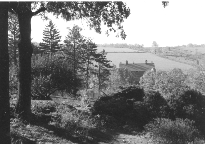
Part of the Glynwood Center landscape includes a working farm. Glynwood is in the Hudson Highlands about 90 km north of New York City.