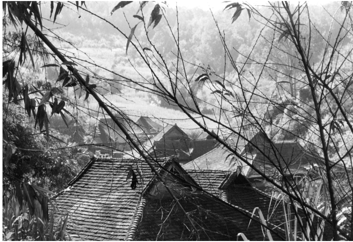
Visit to a Dai-Village in the Xishuangbanna Biosphere Reserve after the South-South Cooperation Meeting in Kunming, China.. Photo: M. Clüsener-Godt, UNESCO, 1997.

A report from India analysed the main objectives and strategies of the concept of ecodevelopment planning, so that conservation of natural resources goes in harmony with socio-economic development (Singh 1997). The implementation of the ecodevelopment concept is detailed step-by-step including planning, institutional structures, transitional phase planning, financial arrangements and criteria for site selection. An indicative plan for ecodevelopment was also detailed at the village level