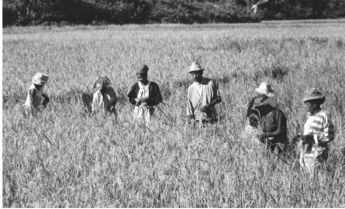
Traditional techniques for rice harvesting in the Manara-Nord region, Madagascar.

Belém, Brazil. This workshop brought together many scientists and managers working in or around Biosphere Reserves or similar managed areas of Latin America. It synthesised information on the management of Biosphere Reserves in Latin America with the aim to build up a methodology analysis for this region and the dynamics of their socio-economic values. Furthermore, the workshop was followed by an International Seminar on “Nature Reserves, Biosphere Reserves and Sustainable Development” in Latin America.