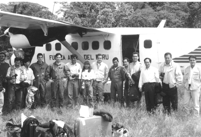
The Network on National Parks has organised and executed over 40 international workshops and seminars on subjects of common interest to the member countries.

of "Technical Cooperation Between Developing Countries" to complement traditional technical cooperation. The conceptual framework was based on the exchange of knowledge and experience amongst developing countries with emphasis on the use of their own resources. The purpose is to make better use of the potential existing in each of the countries of the region, with a view to increasing self-confidence in their own capacity.