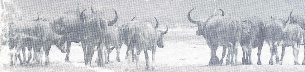
Wild Water Buffalo ( Bubalus arnee ) ( B. bubalus )