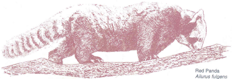
Red Panda Ailurus fulgens

Nepal's Threatened Animals in the IUCN Red List 1994