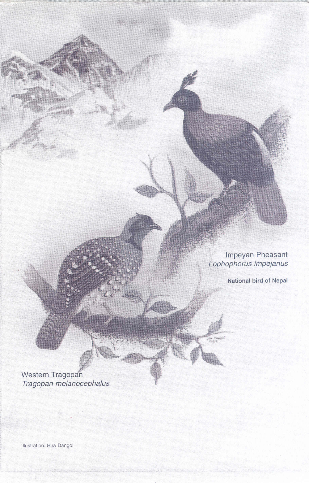
Impeyan Pheasant Lophophorus impejanus