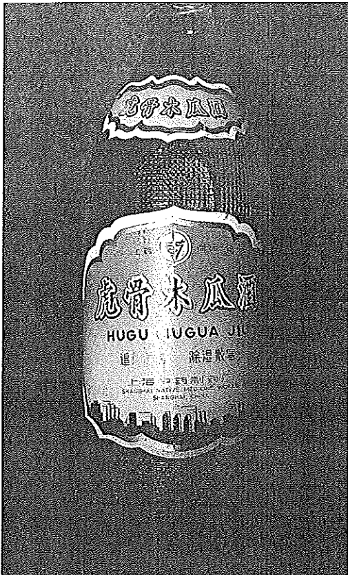
Hugu Mugua Jiu , a formula seen on sale in businesses in 1994 and 1995

Staff in 6 (2.9%) of the businesses showed investigators one or the other of these medicines, in response. In the same year, the 280 businesses visited were visually scanned for the presence of Tiger-bone wine or plaster and one or the other of these medicines was seen on display in only 1 (0.4%) of these.