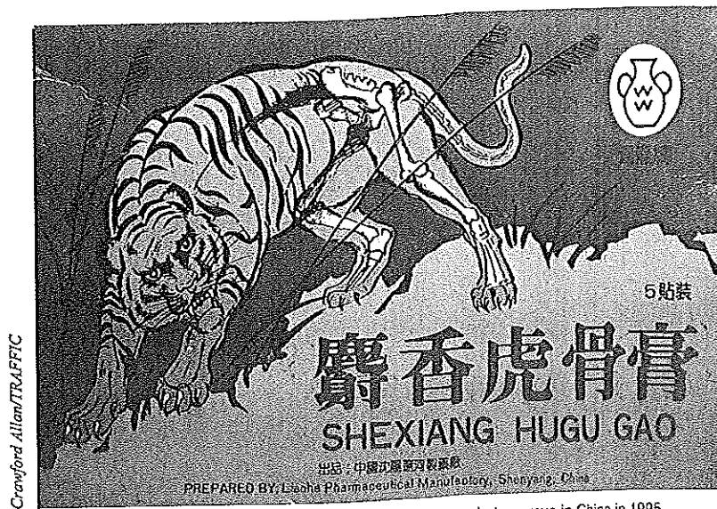
A musk and Tiger-bone plaster of the type seen during market surveys in China in 1995